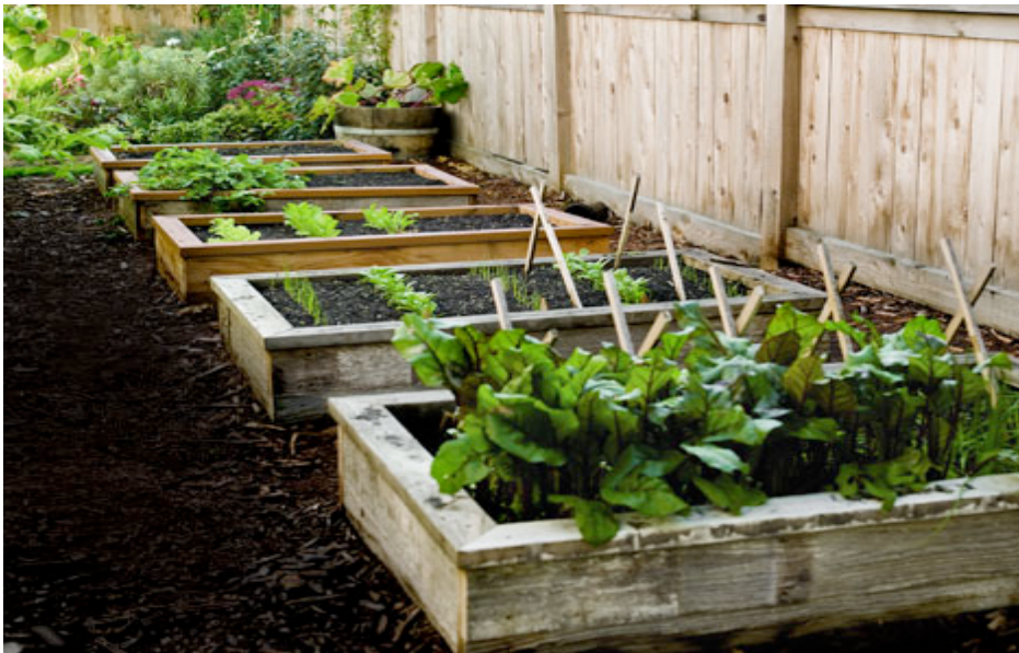
4x4-foot raised beds